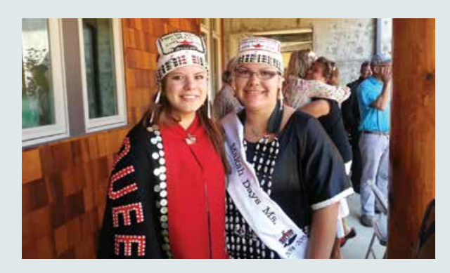
Enterprise Community Loan Fund provided the Makah Tribe with predevelopment financing to create 21 permanently affordable homes for formerly homeless families and individuals on tribal land.