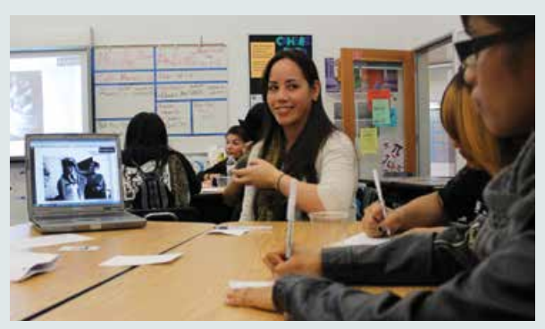
Calvert Foundation is invested in Ánimo Pat Brown, a public charter high school located in the Florence-Firestone neighborhood of South Los Angeles.

In 2014 we continued investing alongside Capital Impact Partners in the ExEd family of funds, providing financing for six public charter schools in Los Angeles. This capital is supporting 3,715 classroom seats in majority Latino neighborhoods in LA. In Baltimore, we invested $4.9 million in the Monarch Public Charter School in Baltimore together with The Reinvestment Fund (TRF), representing our first participation loan with TRF. This investment is funding the development of a community health center and three new classrooms, as well as additional playground space. At the end of 2014 we had a total of $21.3 million invested targeted to education.