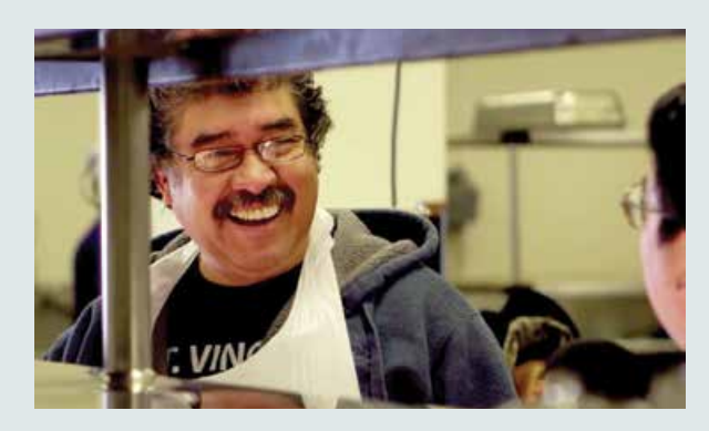
L.A. Prep's facility opened in January 2015 and currently houses 54 tenant food companies including L.A. Kitchen, a nonprofit focused on job training and providing healthy and affordable nutrition to seniors.

LifeLong Medical Care is a dynamic nonprofit community organization with nine locations in the Bay area delivering quality health services for all ages. Through their housing program, they're working with people recovering from homelessness, substance abuse, and/or mental illness.