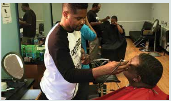
Justine Petersen Inc., granted micro loans to more than 50 businesses in the past year affected by the aftermath of the Ferguson, MO riots, including Kritique Designs.

Small and medium businesses are the engines of economic prosperity and jobs in the U.S. However, entrepreneurs often struggle to get financing from traditional sources because they lack the credit history, collateral, or are their financing needs are too small. Whether it's a barber shop, a bakery, or an animal hospital, what small businesses have in common is a need for affordable, flexible working financing. The CDFIs in our portfolio provide this type of financing, and can also quickly provide capital at critical times to help small businesses recover from shock--such as after the Ferguson unrest. At year end 2014, our CDFI partners were targeting $16.9 million of our total investments in them to small business lending and jobs creation. We targeted $7.9 million in loans to small business in 2014, resulting in the creation or preservation of 5,154 jobs.